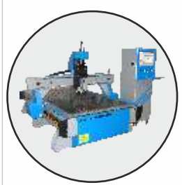
Other CNC Router GX Series..[Servo]