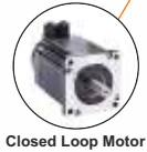
Closed Loop Motor