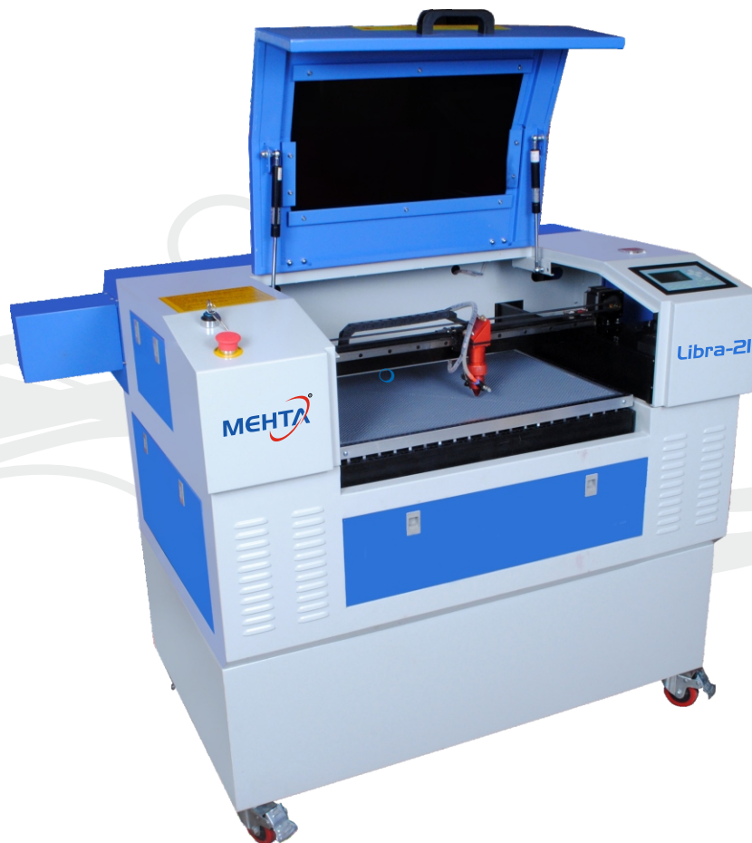
LIBRA-21 600 x 400 mm, 60W